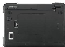
Integrated Bio reader (Optional)