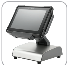
Adjustable POS Base and flip up to 135 degrees at customer-end (X3-10/20)