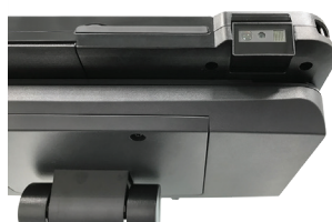
Rotatable 2D barcode scanner