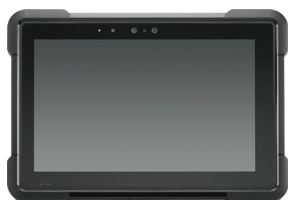
10.1" with auto rotation function Integrated NFC reader

*Specification is subject to change without prior notice