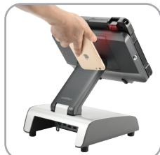
Patented keylock-free design Rotatable 2D barcode scanner (X3-10/20)