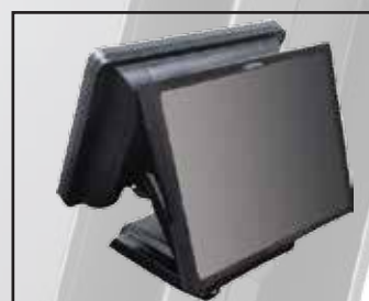
SP-820 with the 15" Bezel Free LCD (Optional)