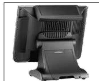
SP-820 with the 2x20 VFD (Optional)