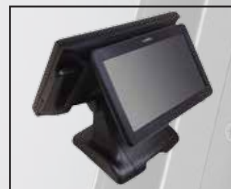
SP-820 with the 11.6" LCD (Optional)