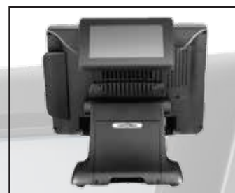
SP-820 with the 7" LCD (Optional)