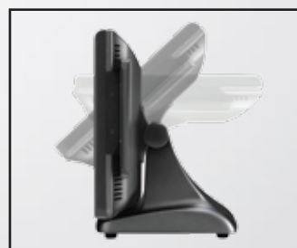
Wide Tilt Angle