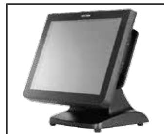
SP-820 Bezel Free (Optional)