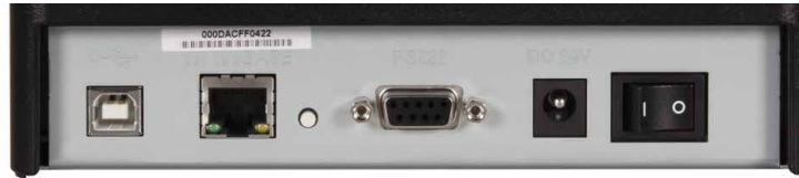
Ethernet LAN, USB & Serial interfaces as standard