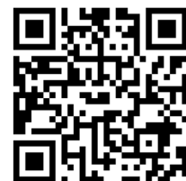
SC1-QB Web page